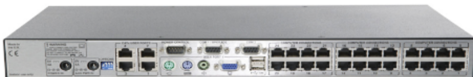
AdderView CATx IP KVM Switch